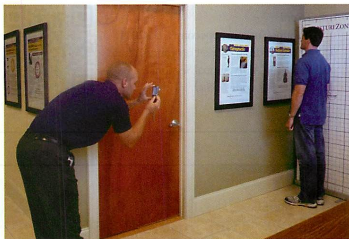
Ask a friend to take your picture from the front, back and side so that you can monitor your posture.